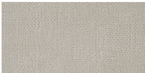
RHAPSODY 5015/0002 - Fawn