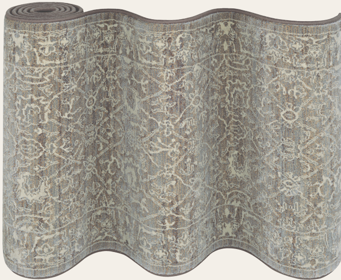
PERSIAN ARABESQUE - CHARCOAL 26" 6340|0001A – Length Repeat: 50.87" 31" 6340|B001A – Length Repeat: 67.63"

100% Heat-Set Courtron™ Polypropylene, Face-to-Face Woven Wilton Soft, Luxurious Finish Featuring One Million Points of Yarn Per Square Meter