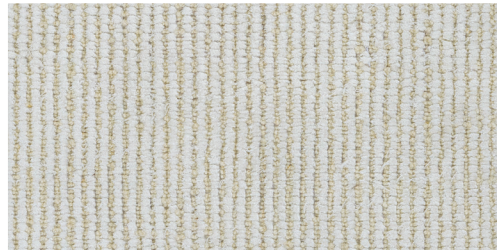
DIMENSIONS 6015/0001 - Birch