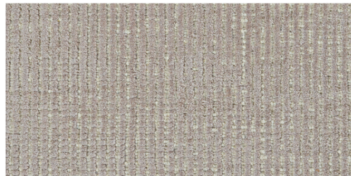
DIMENSIONS 6015/0004 - Mocha