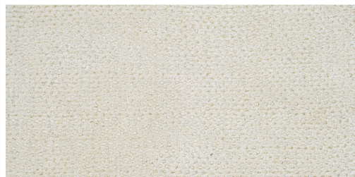
RHAPSODY 5015/0001 - Coconut

BRAND: Premiere, PILE: 70% Tencel®/30% Wool, WEAVE: Hand-Loomed Cut and Loop Pile, WIDTH: 15', REPEAT: .75" Wide Available in: Birch, Toffee, Mocha, Cornflower and Putty (shown)