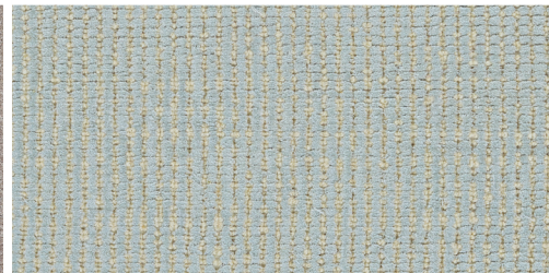
DIMENSIONS 6015/0005 - Cornflower

BRAND: Premiere, PILE: 70% Tencel®/30% Wool, WEAVE: Hand-Loomed Cut and Loop Pile, WIDTH: 15', REPEAT: .75" Wide Available in: Birch, Toffee, Mocha, Cornflower and Putty (shown)