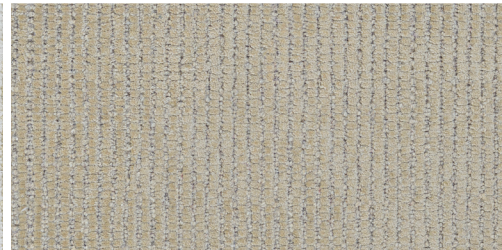
DIMENSIONS 6015/0003 - Toffee