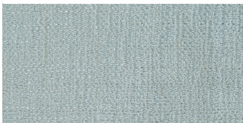
RHAPSODY 5015/0004 - Pale Blue Mist