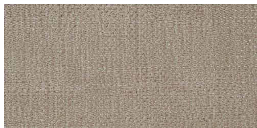
RHAPSODY 5015/0003 - Cocoa Powder