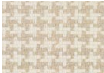
OAKLEY PT30/0001 - Barley