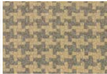
OAKLEY PT30/0002 - Grey