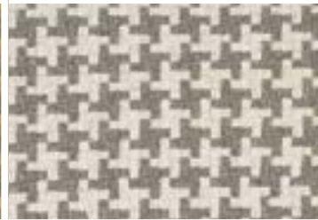
OAKLEY PT30/0003 - Smoke