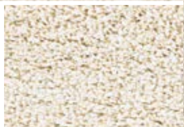
TELLURIDE CB15/0002 - Eggshell

BRAND: Purity®, PILE: 100% Undyed Natural Wool, WEAVE: Hand-Loomed Flatweave, WIDTH: 15', REPEAT: 2.25" W x 2.25" L (Straight Match) Available in: Grey, Smoke, and Barley (shown)