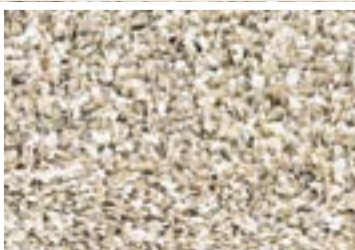
TELLURIDE CB15/0003 - Cappuccino