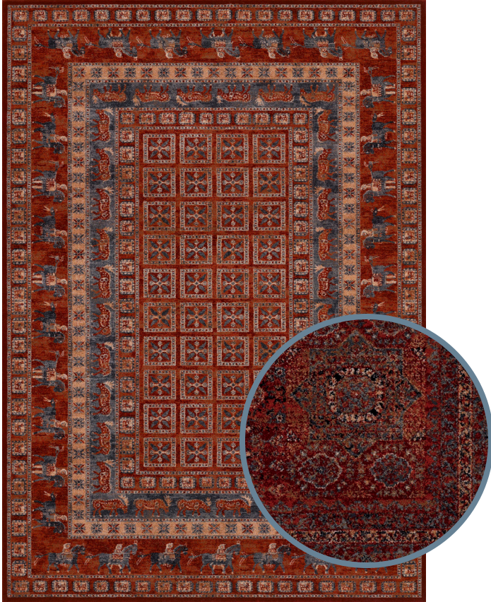
1660/1300 Pazyrk/Antique Red ■ ■