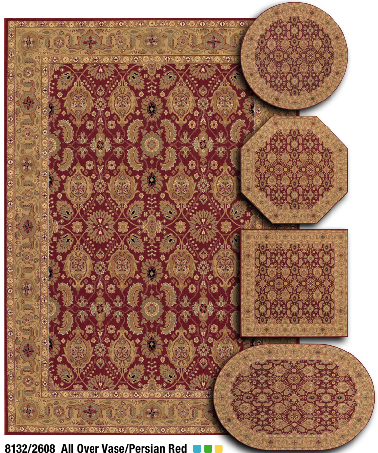
8132/2608 All Over Vase/Persian Red ■ ■ ■