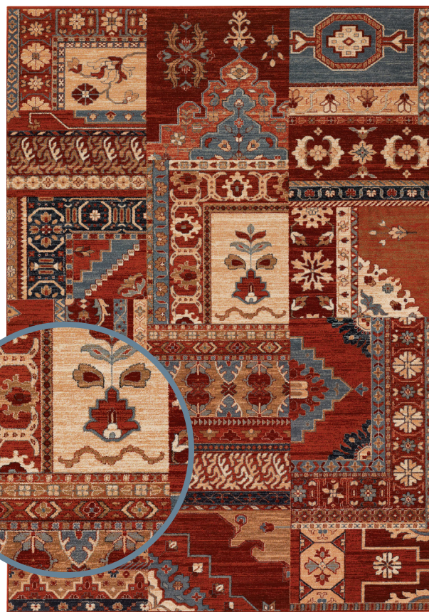
4323/0300 Kerman Mosaic/Burgundy-Rust ■ ■