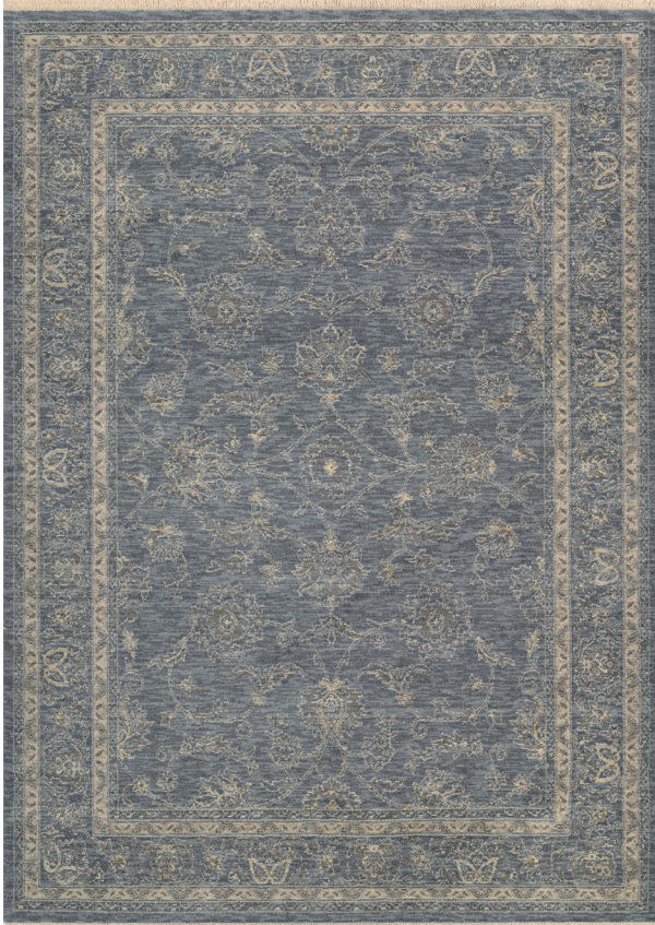
4517/0501 Aurelia/Dusty Blue-Beige