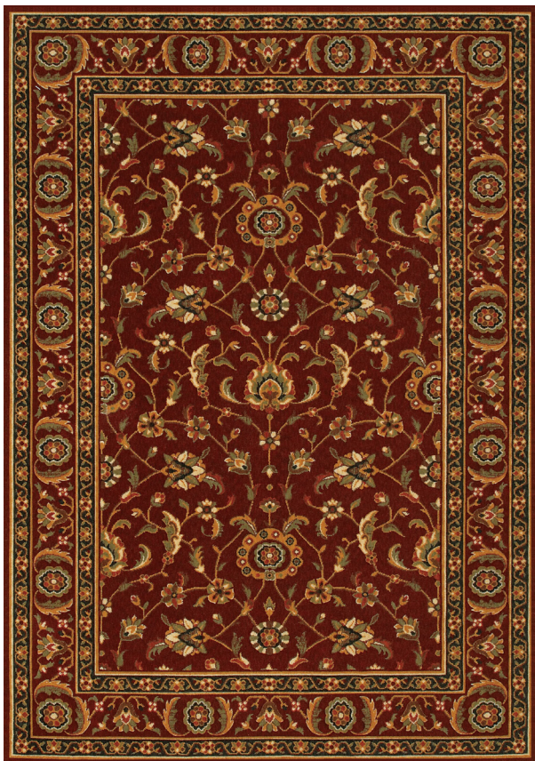
1323/0002 Brentwood/Bordeaux ■ ■ ■