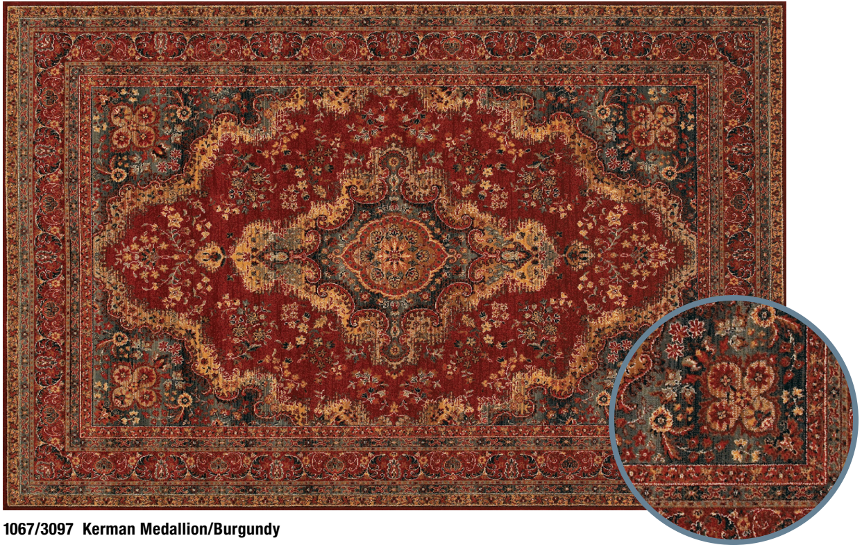
1067/3097 Kerman Medallion/Burgundy