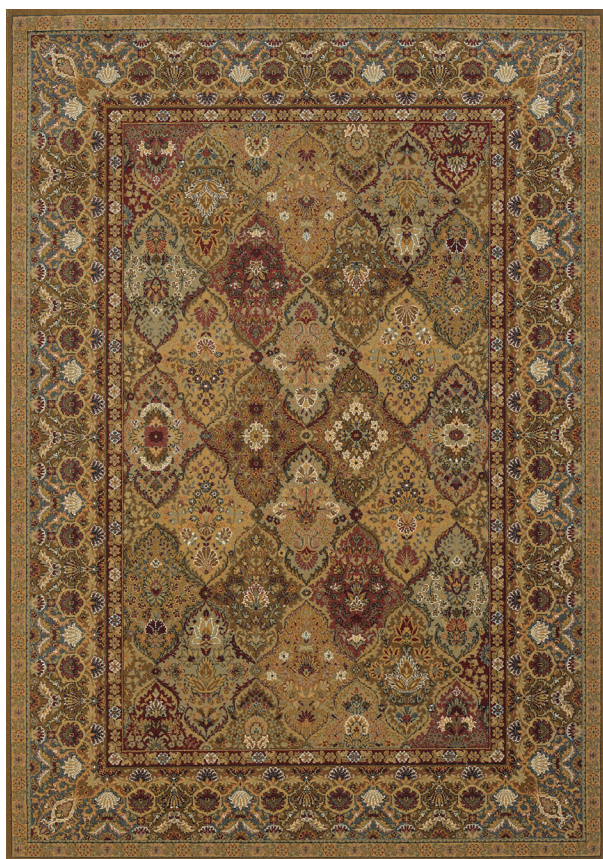
8042/9342 Persian Panel/Hazelnut