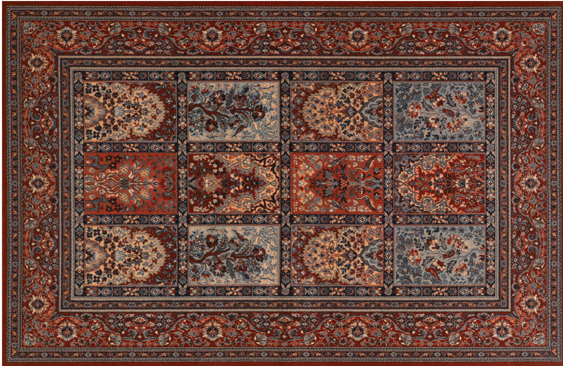
4325/0300 Vintage Baktiari/Burgundy ■ ■