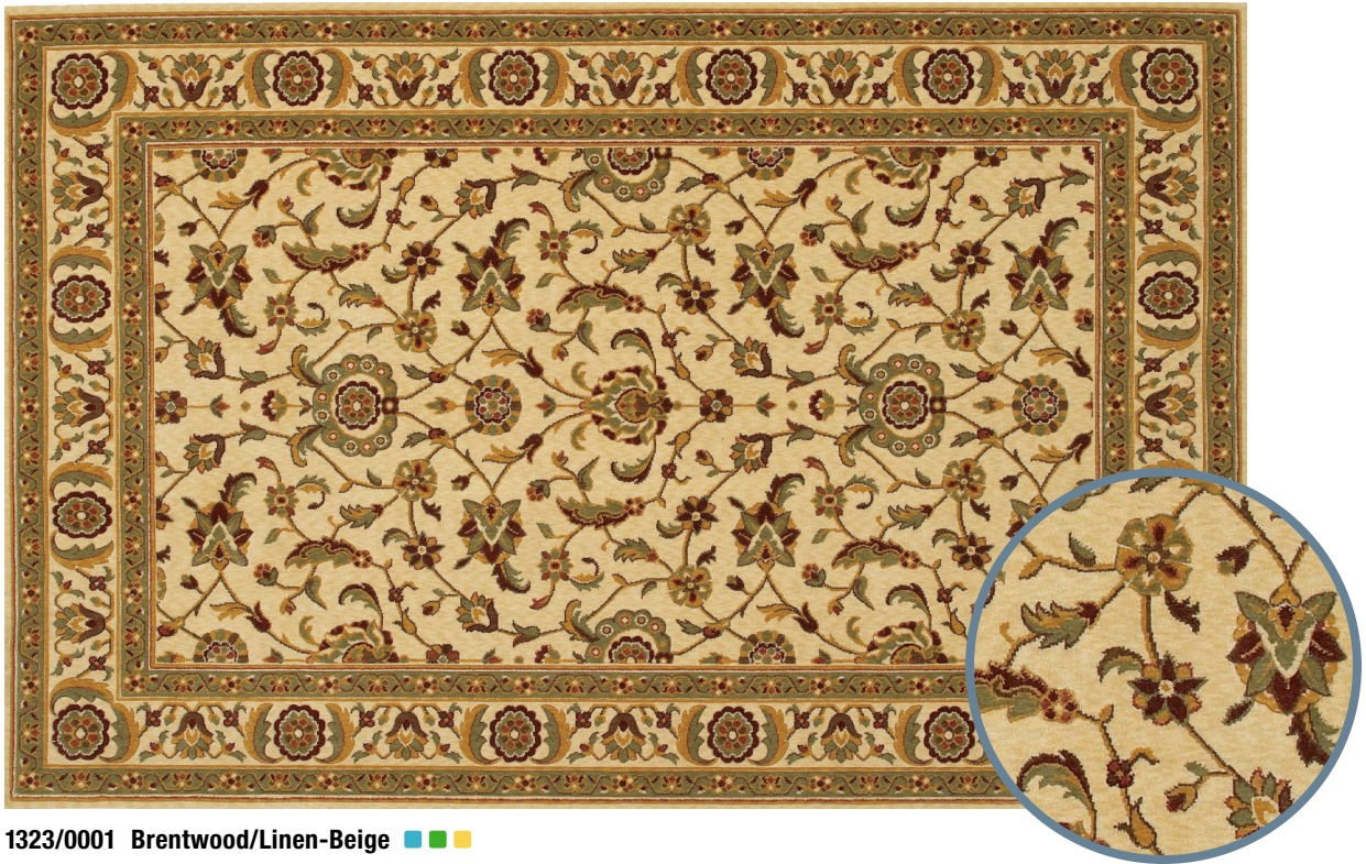
1323/0001 Brentwood/Linen-Beige ■ ■ ■