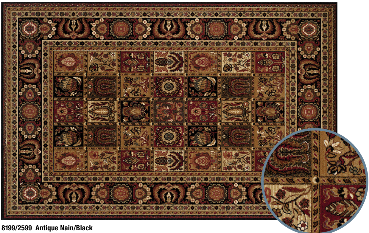
8199/2599 Antique Nain/Black