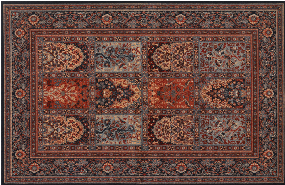
4325/0500 Vintage Baktiari/Ebony ■ ■