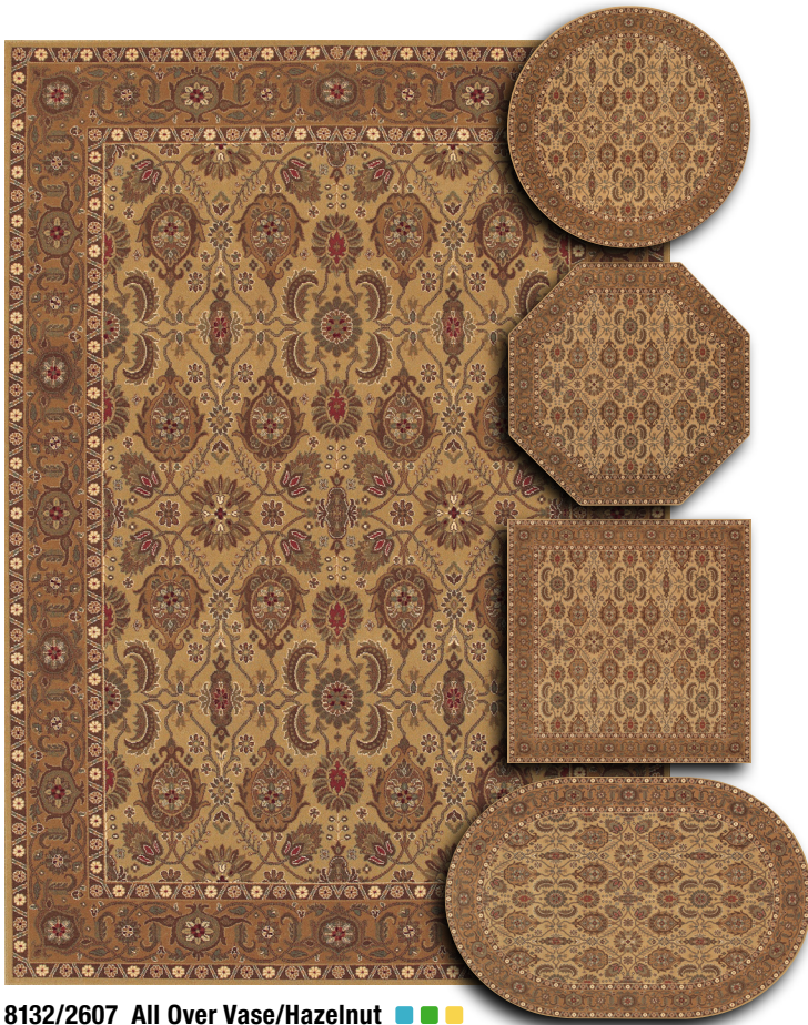
8132/2607 All Over Vase/Hazelnut ■ ■ ■