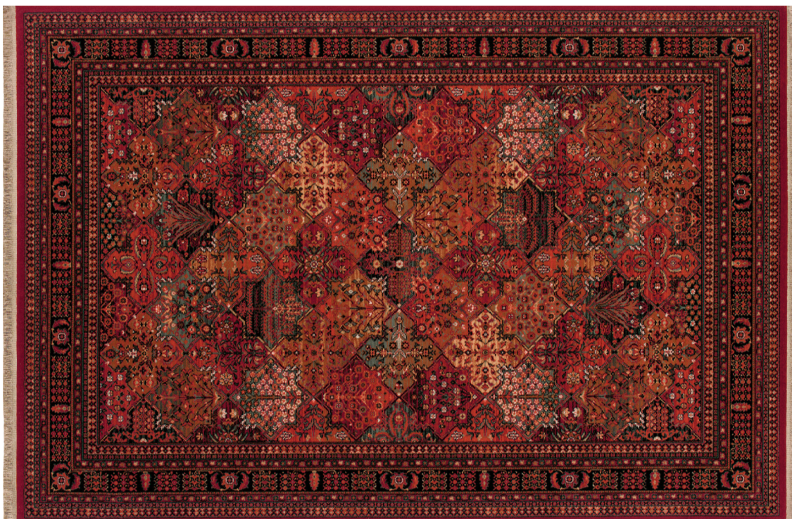
8143/3203 Imperial Baktiari/Antique Red ■ ■ ■