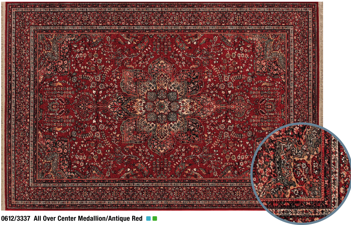
0612/3337 All Over Center Medallion/Antique Red ■ ■ ■