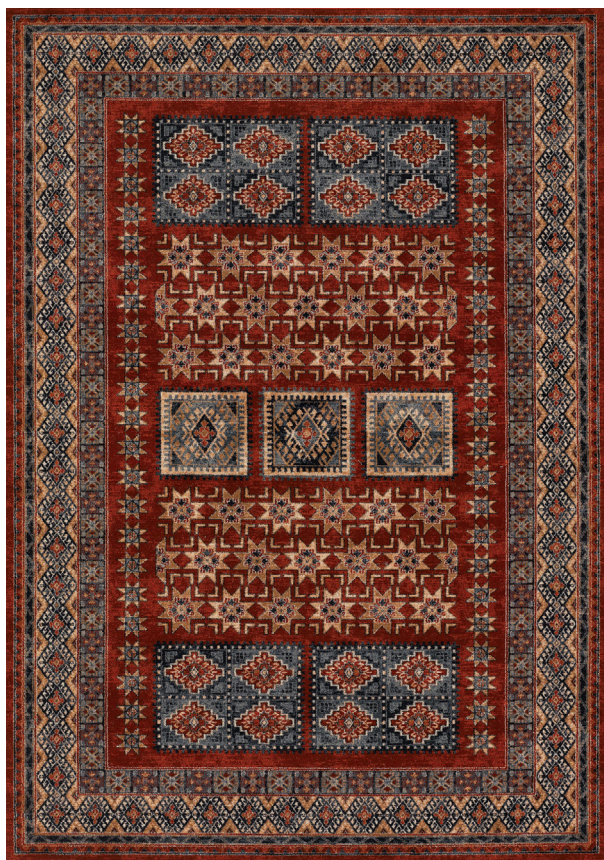
4307/0300 Royal Kazak/Burgundy ■ ■