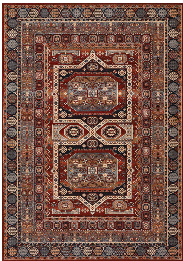
4324/0300 Maharaja/Burgundy ■ ■