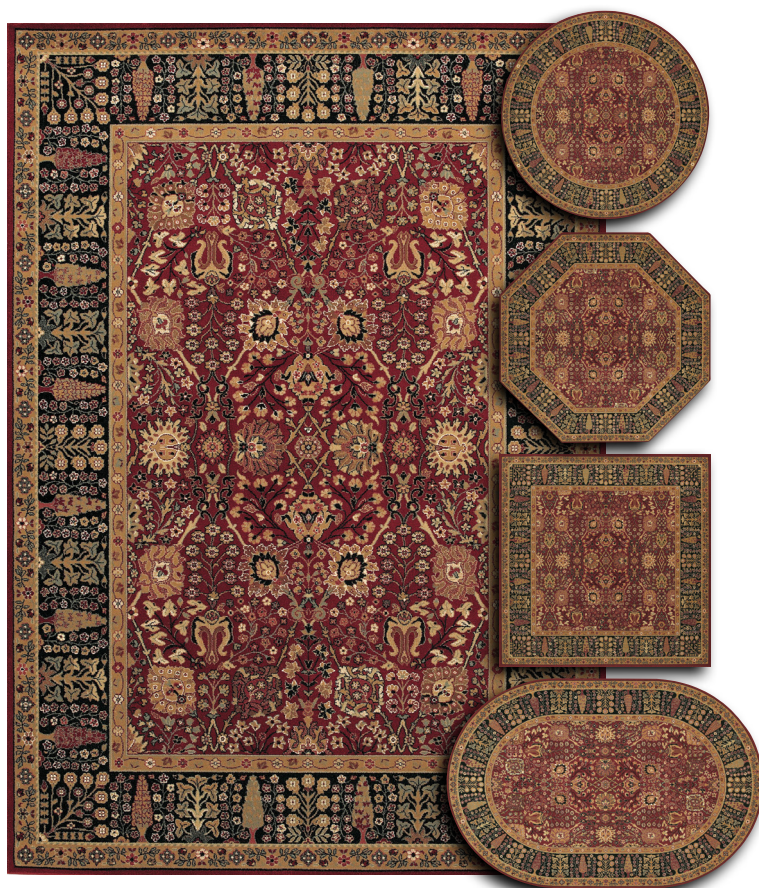
0621/2597 Cypress Garden/Persian Red ■ ■