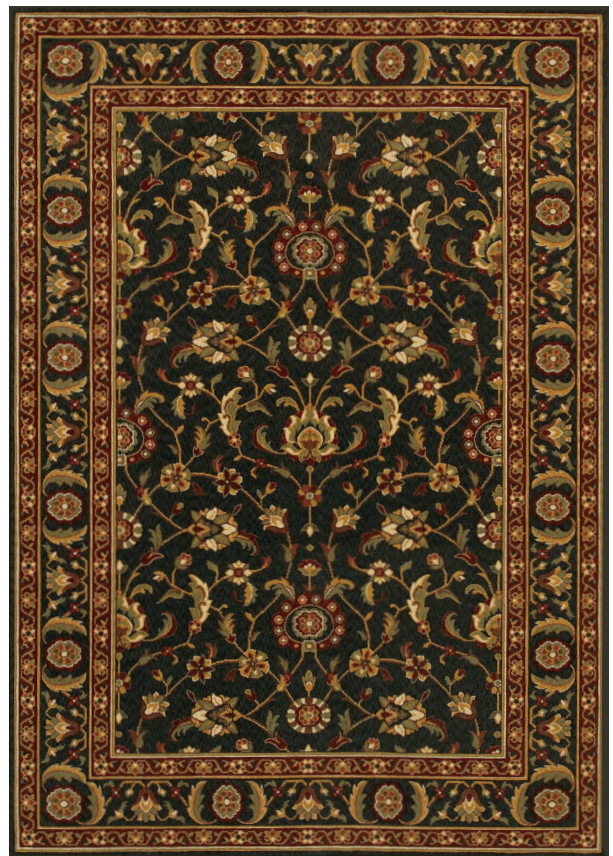
1323/0003 Brentwood/Ebony ■ ■ ■