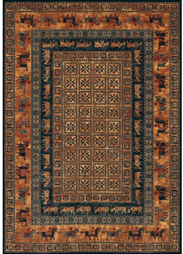
1660/3066 Pazyrk/Burnished Rust ■ ■