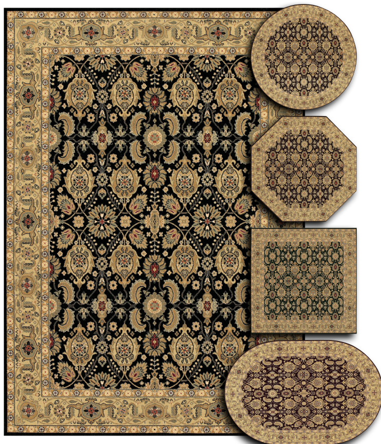
8132/2606 All Over Vase/Black-Deep Maple ■ ■ ■