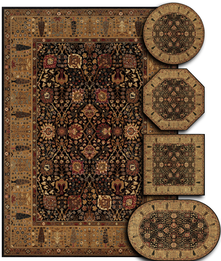
0621/2596 Cypress Garden/Black-Deep Maple