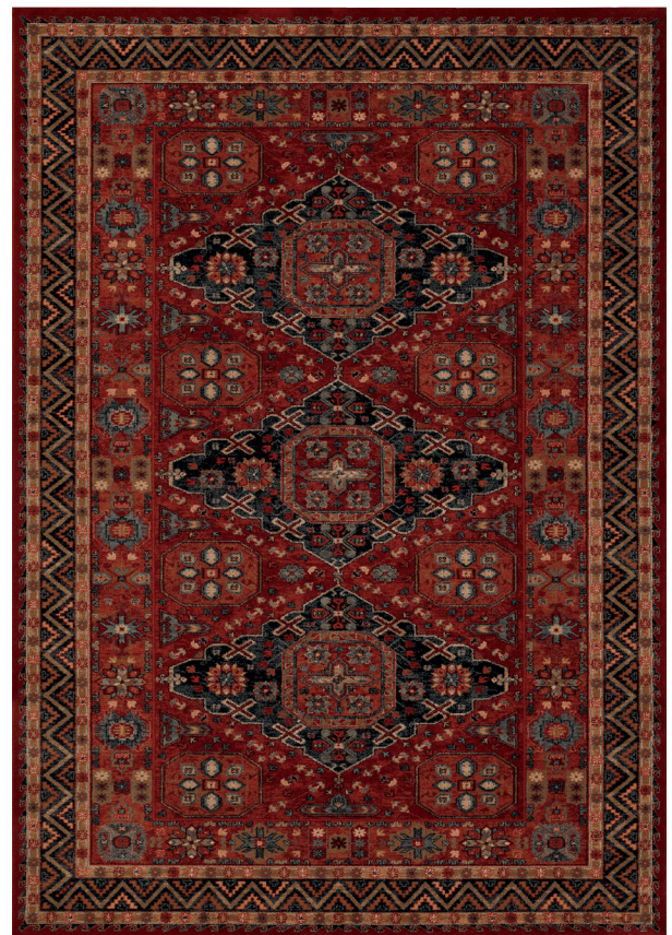
4308/0300 Kashkai/Burgundy ■ ■ ■