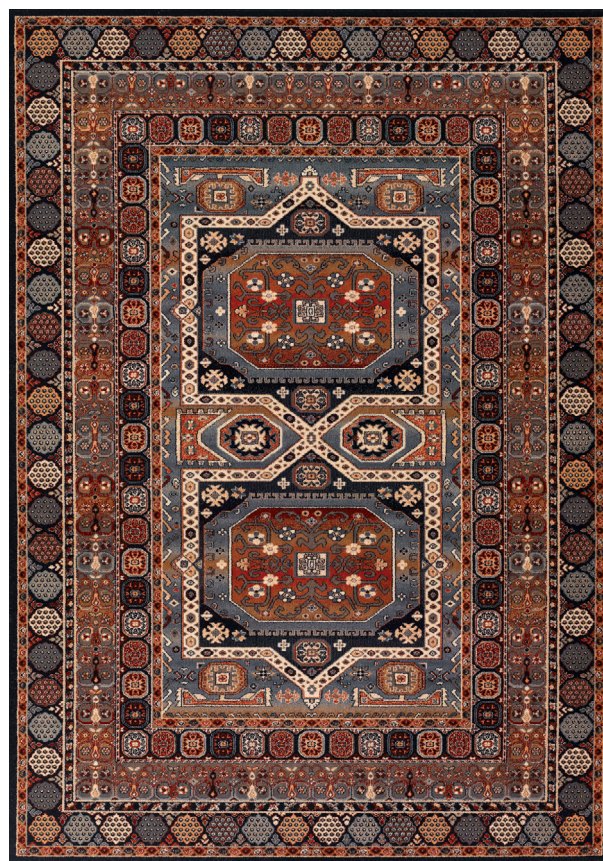
4324/0500 Maharaja/Ebony ■ ■